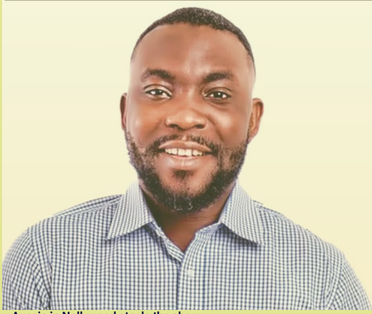
Aussie in Nollywood steals the show

The Yoruba Storyteller Bringing Cultural Heritage to the Global Stage