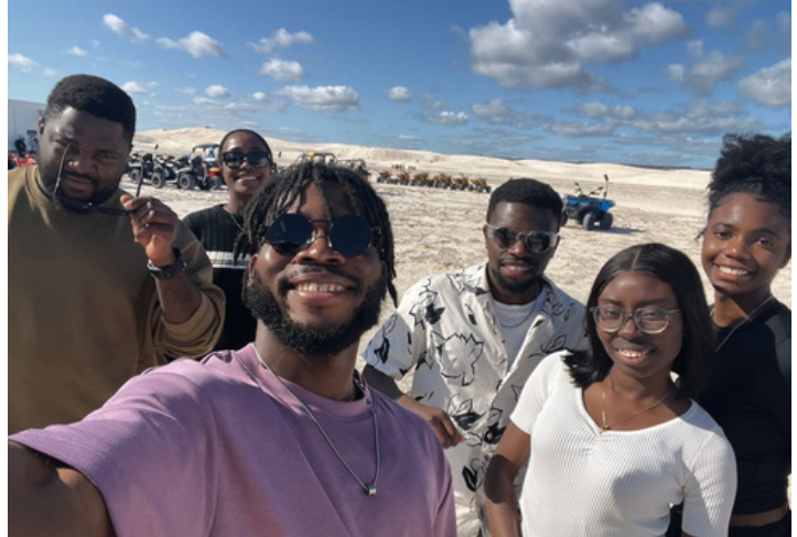
Somewhere along the Dunes in Lancelin, the youth stopped for a pose