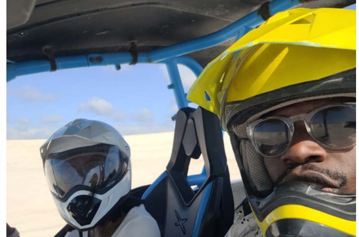
4WD Experience at the Youth Hangout in Lancelin